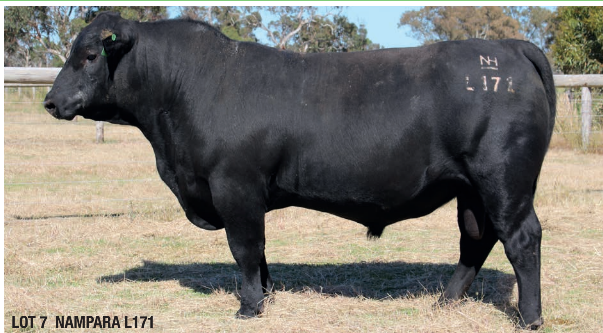
LOT 7 NAMPARA L171