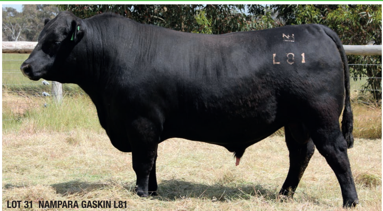
LOT 31 NAMPARA GASKIN L81