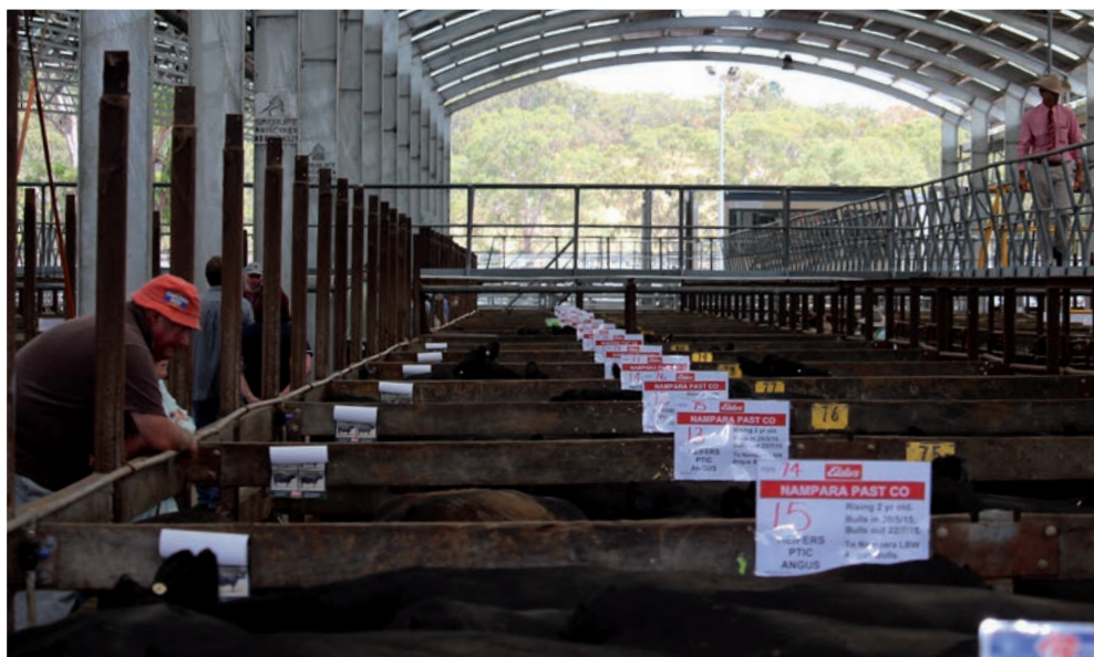
Part of Nampara's 360 head draft of joined females at the 2016 Naracoorte PTIC Feature Female Sale.

First calves of this $70,000 sale topper on the ground.