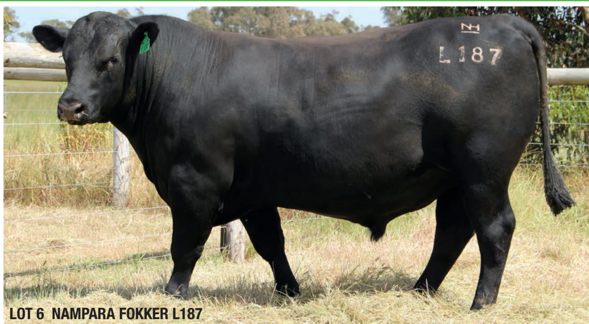
LOT 6 NAMPARA FOKKER L187