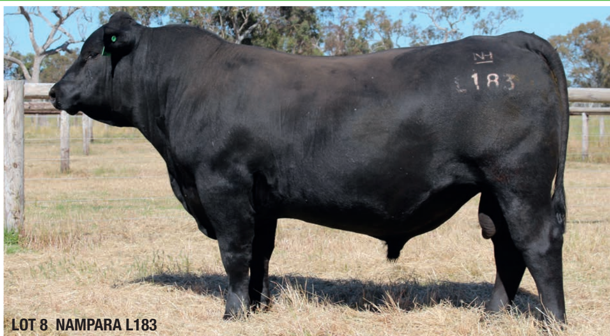
LOT 8 NAMPARA L183