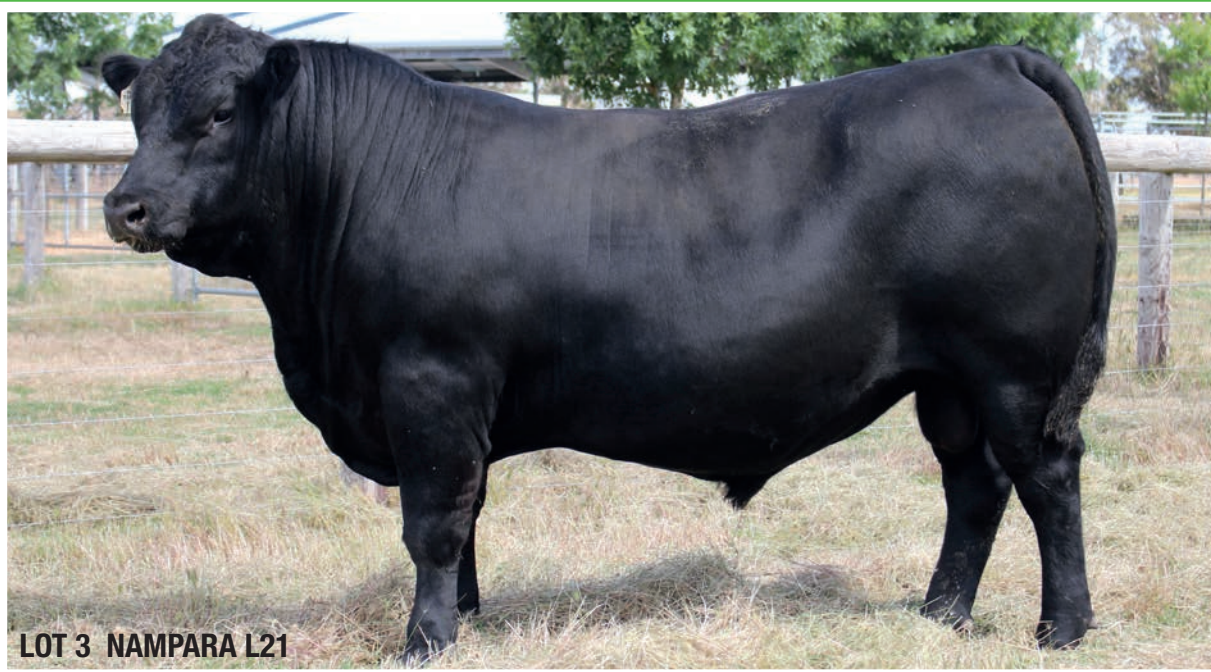
LOT 3 NAMPARA L21