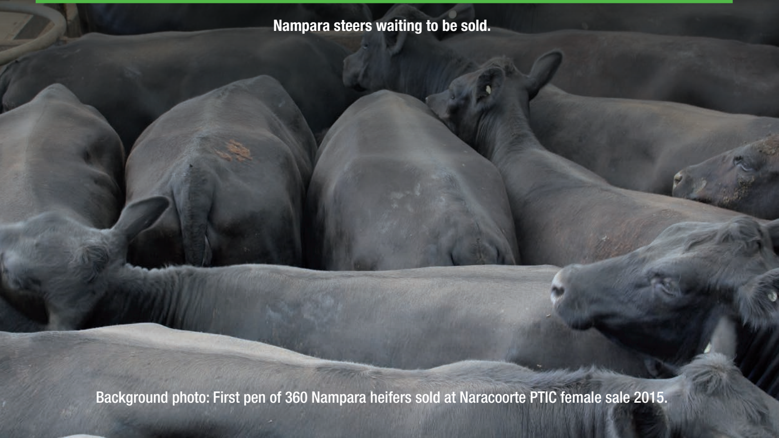
Background photo: First pen of 360 Nampara heifers sold at Naracoorte PTIC female sale 2015.