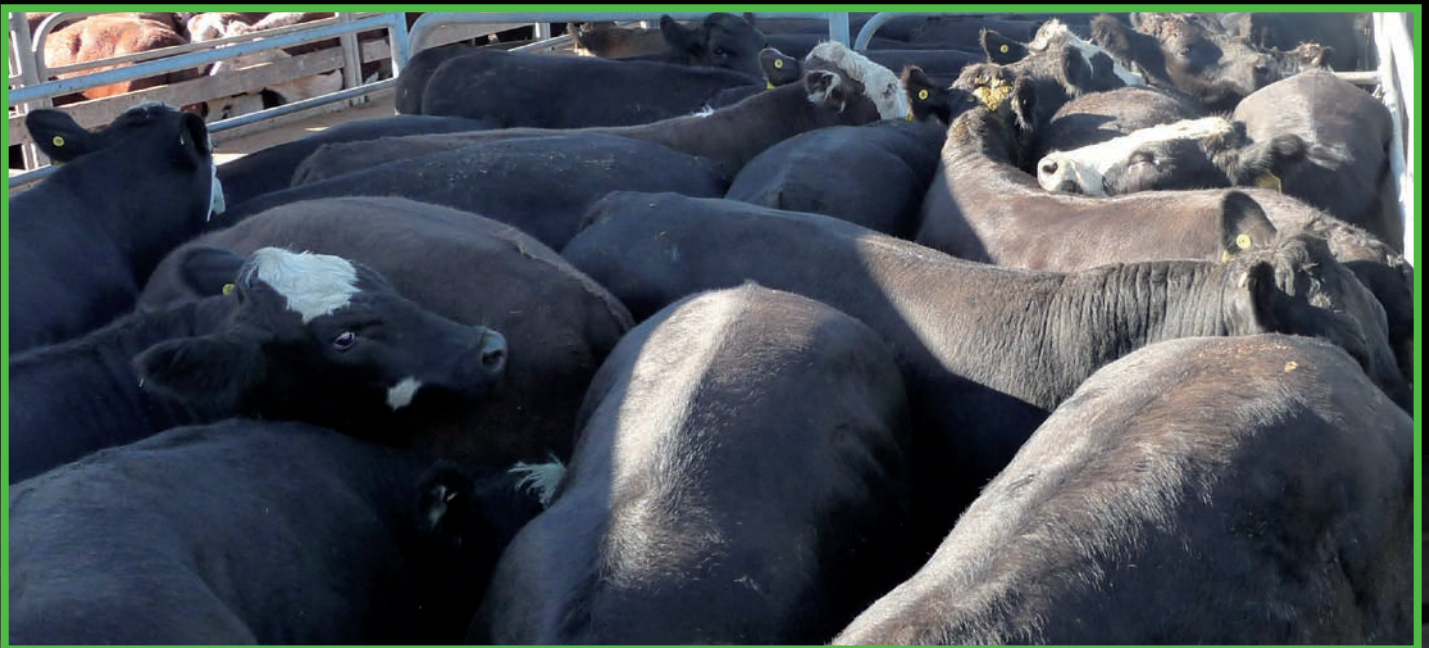
Nampara steers waiting to be sold.