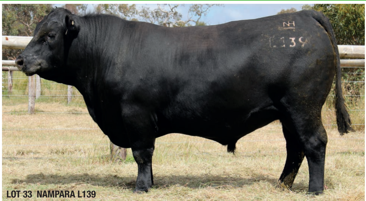
LOT 33 NAMPARA L139