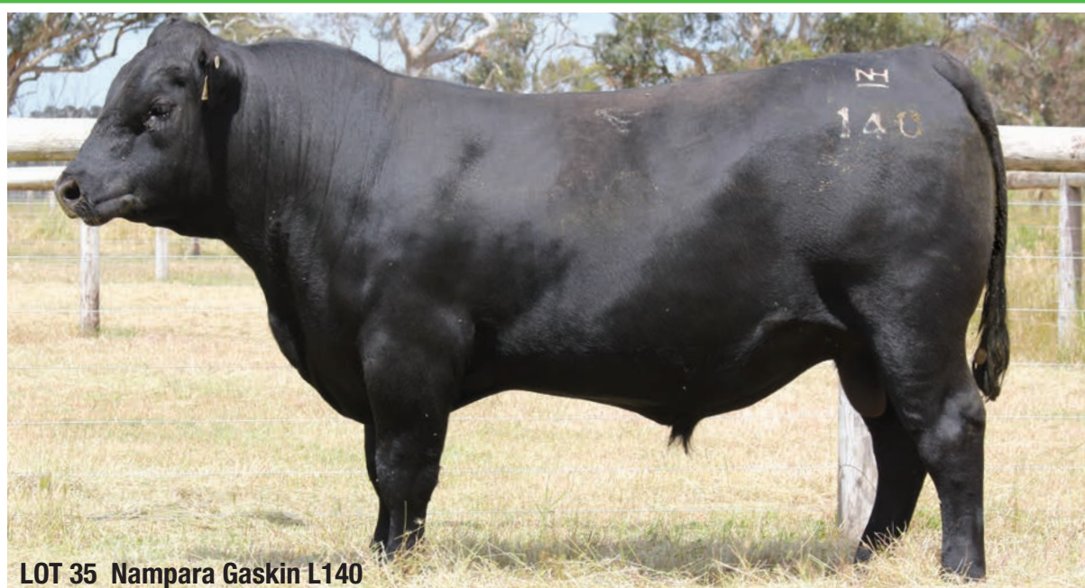
LOT 35 Nampara Gaskin L140