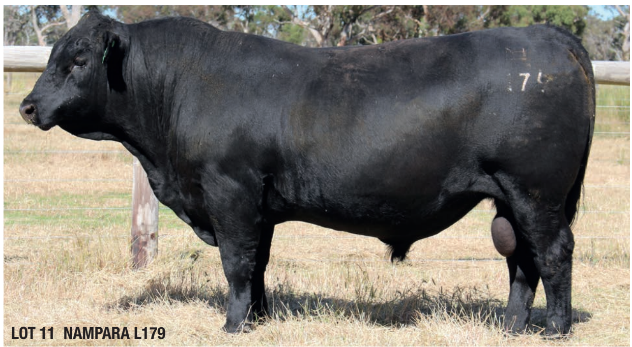
LOT 11 NAMPARA L179