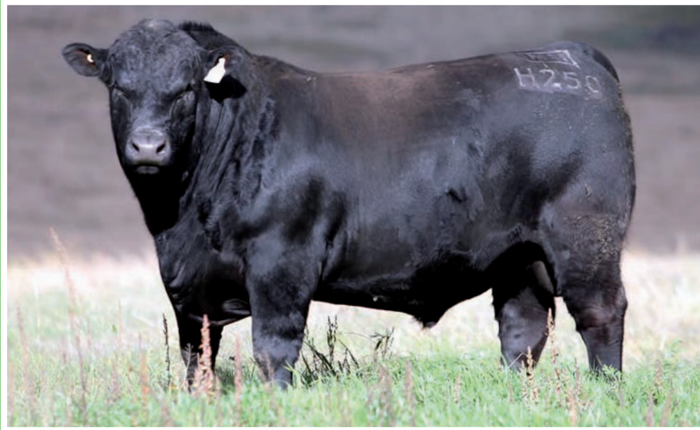
Millah Murrah Hercules H250

First calves of this $70,000 sale topper on the ground.