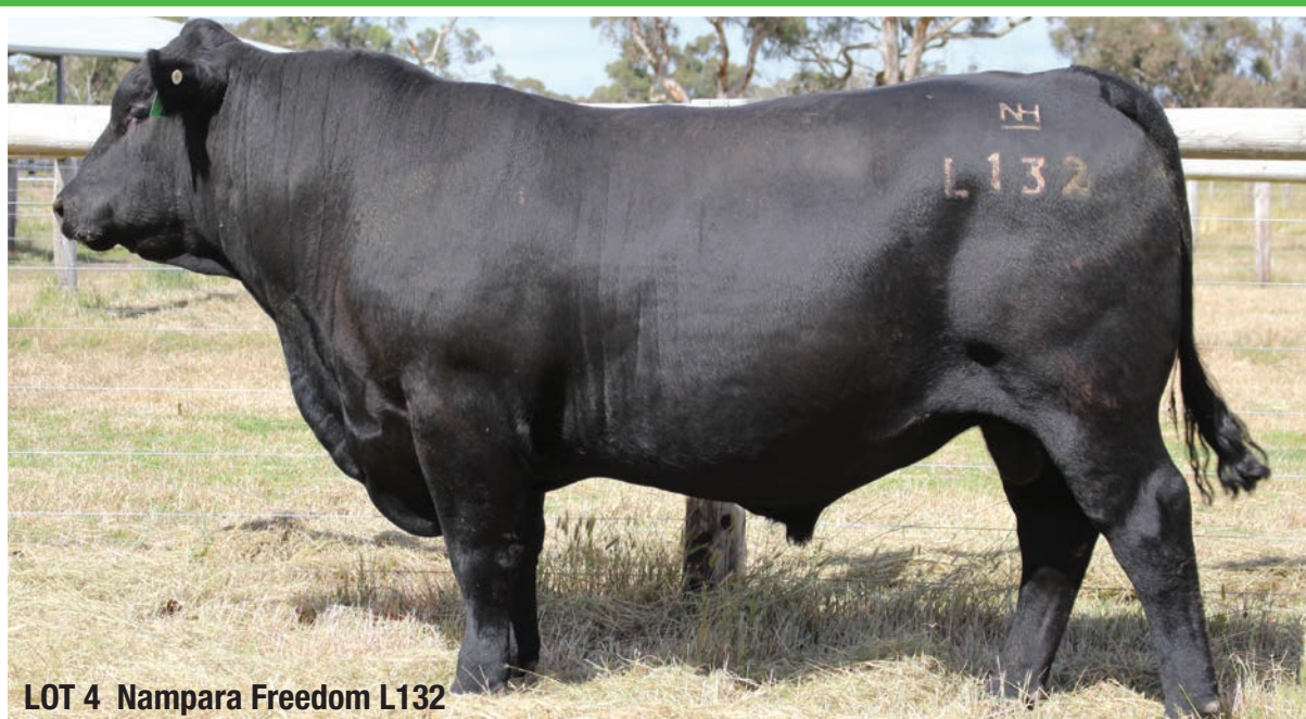
LOT 4 Nampara Freedom L132