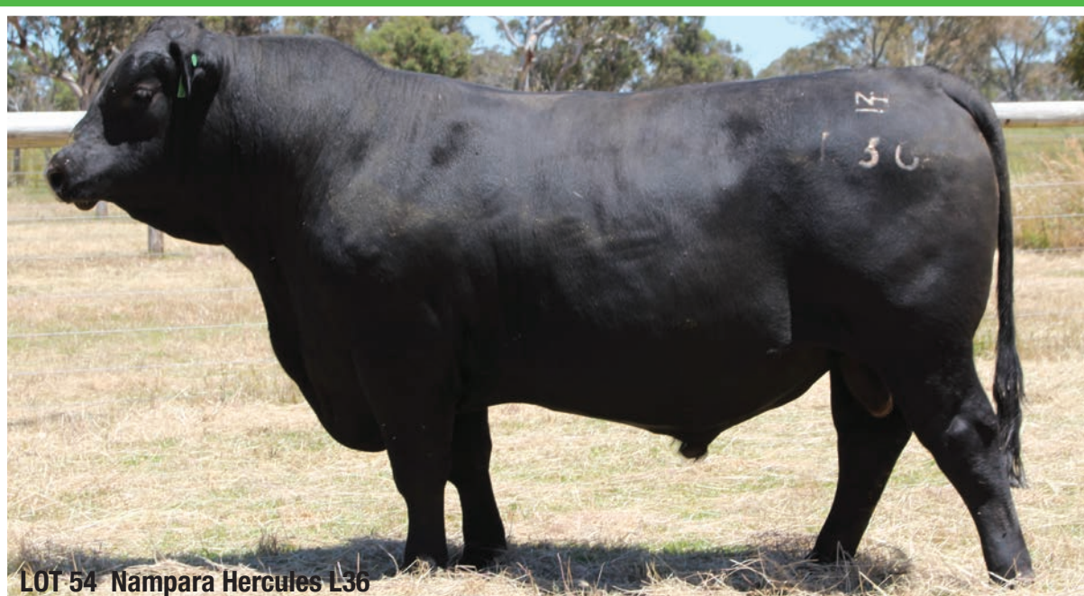
LOT 54 Nampara Hercules L36