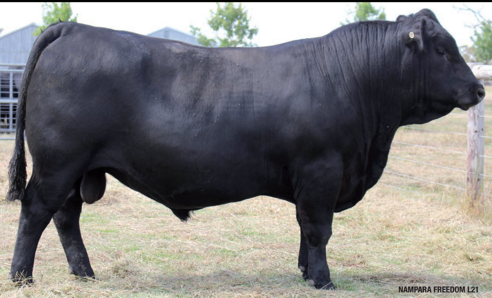
NAMPARA FREEDOM L21

On-farm, 25kms south on Coles-Spence Road, Lucindale South, South Australia