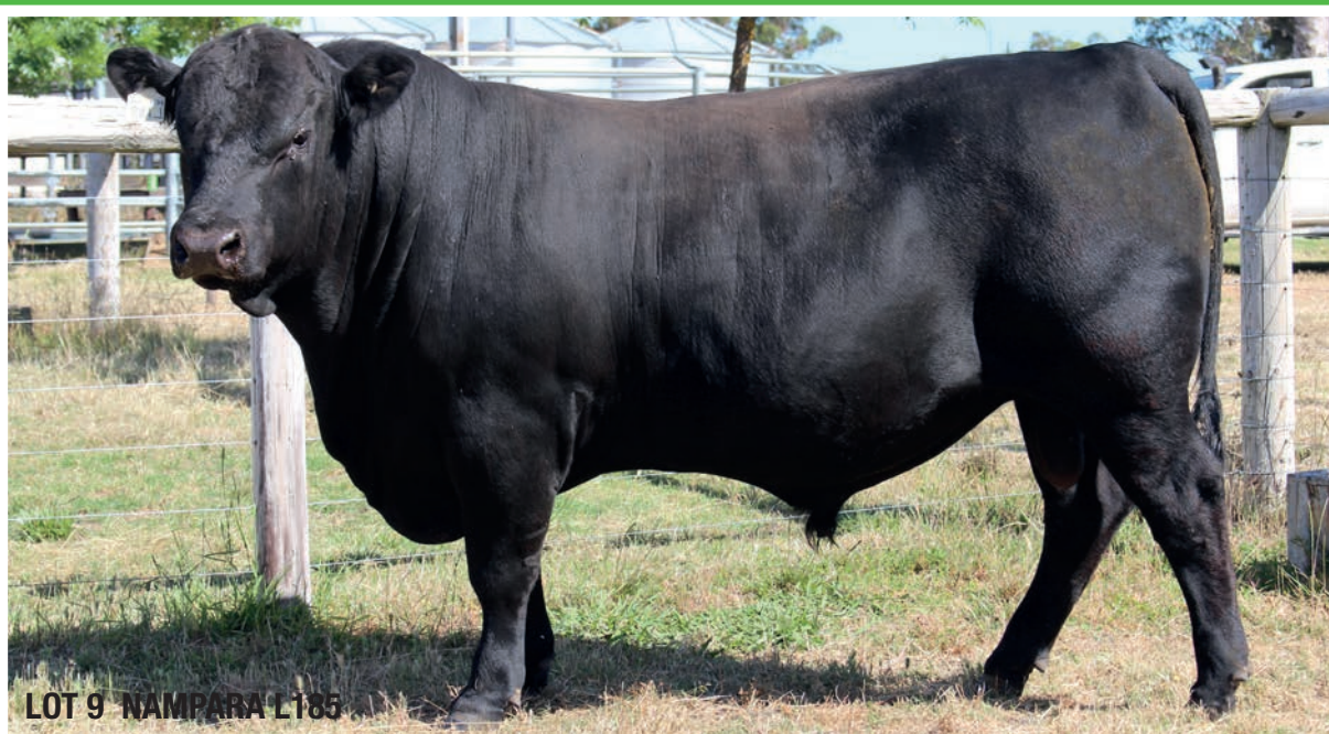
LOT 9 NAMPARA L185