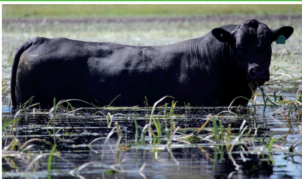
Lot 8 Nampara Hercules L183