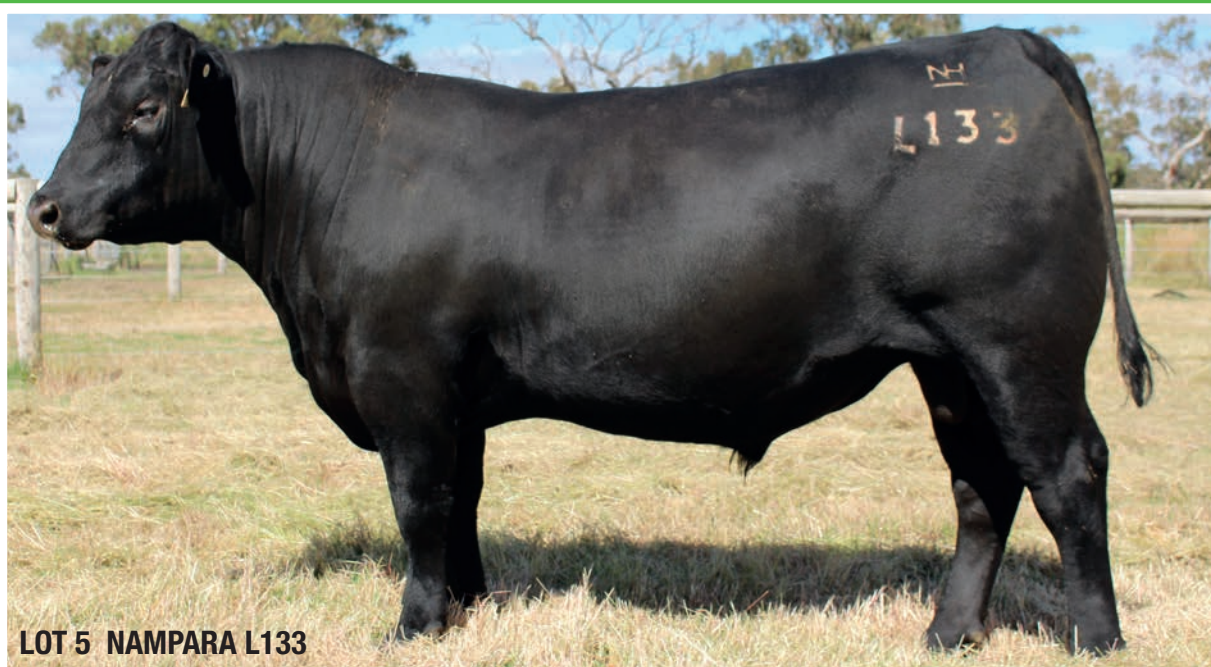
LOT 5 NAMPARA L133